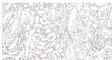
Immunohistochemical analysis of paraffin embedded human kidney tissue slide using IHC0492H (Human METTL3 IHC Kit).