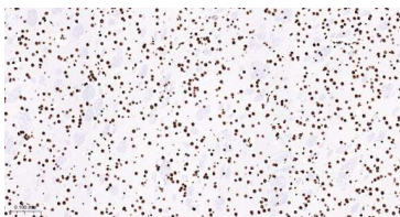
Immunohistochemical analysis of paraffin embedded rat brain tissue slide using IHC0484 (Histone H4 IHC Kit).