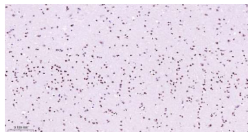
Immunohistochemical analysis of paraffin embedded human brain tissue slide using IHC0482 (Phospho-STAT5A (Y694) IHC Kit).