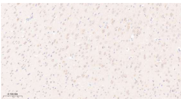
Immunohistochemical analysis of paraffin embedded rat brain tissue slide using IHC0476 (mTOR IHC Kit).