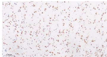
Immunohistochemical analysis of paraffin embedded human right occipital lobe tissue slide using IHC0468 (FMR1 IHC Kit).