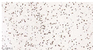
Immunohistochemical analysis of paraffin embedded human brain tissue slide using IHC0462H (Human Lamin B2 IHC Kit).