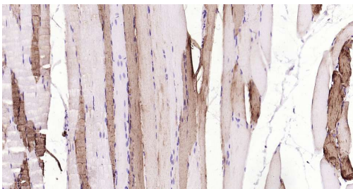
Immunohistochemical analysis of paraffin embedded rat skeletal muscle tissue slide using IHC0365R (Rat Myoglobin Kit).