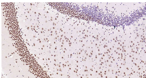
Immunohistochemical analysis of paraffin embedded mouse brain tissue slide using IHC0345 (Phospho-CREB-1 (Ser133) Kit).