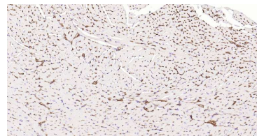
Immunohistochemical analysis of paraffin embedded mouse heart tissue slide using IHC0255 (AQP1 IHC Kit).